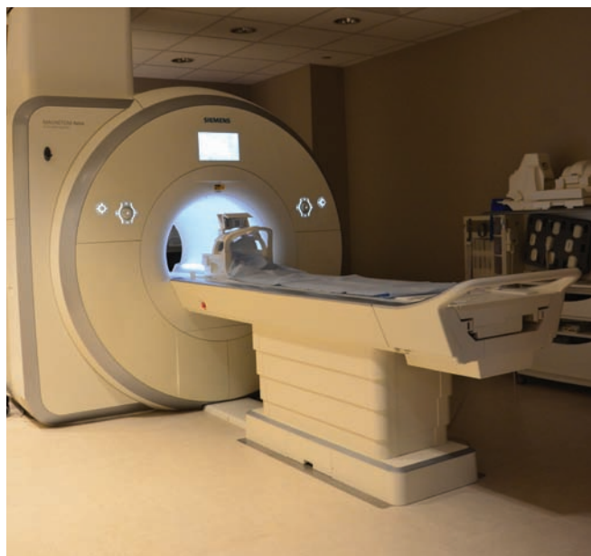
The Siemens Magnetom Aera at WK Pierremont has open space for greater patient comfort during MRI scans.

The breast MRI at WK Pierremont enhances the health system's advanced breast care program, which introduced 3-D digital breast tomosynthesis last year. A dedicated clinical breast care radiologist has been added who actively consults with patients at high risk for cancer. The goal is to decrease the time from a patient's screening exam to the time of a surgery referral. Patients have reported a higher level of satisfaction because they are given the result of their diagnostic exams before they leave the hospital.